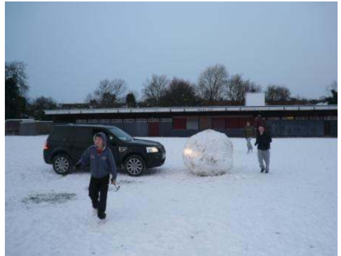
But how do you move it? Answer: You can't!!

METRO ROD DRAIN CARE AND REPAIR 020 8449 8477