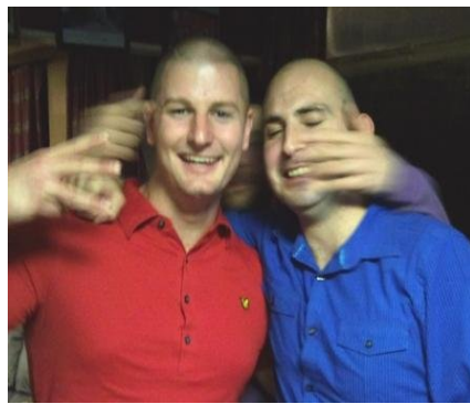
3bog – Sterralizer, Pearce